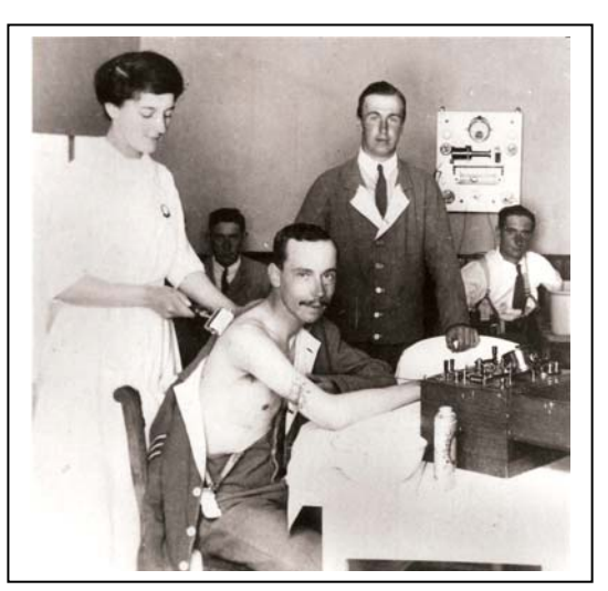
Church Street Hospital, July 1918

So it seems that innovative techniques for treating muscle wastage had come to Corsham.