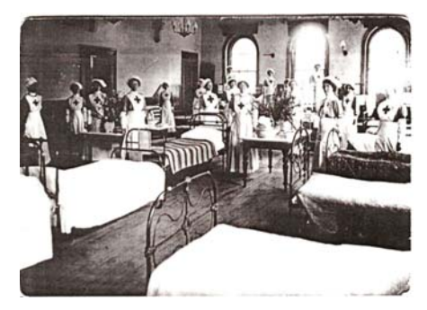
Town Hall Hospital 1914

By 1915 the Parish Council found it necessary to remove the fixed seating around the council Chamber, and to have another 'stove installed in the large ward'. In 1916 the Parish Minutes recall the concern being expressed at the importation of troops from Chippenham to Corsham hospital, when they had contracted measles.