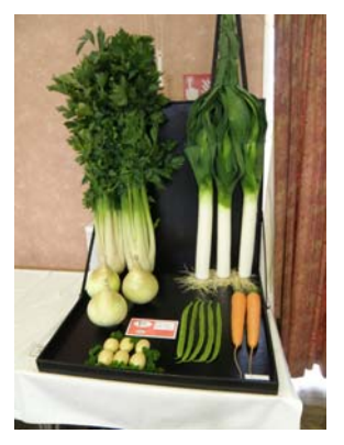
Annual flower show and vegetable exhibit

Then there is the annual flower and vegetable show. This is recognised as one of the best of the local shows. Last year there were 190 different classes. These include Flowers (multiple, single and arrangements), Vegetables (large, mixed and comical), Cookery, Wines, Handicrafts, Photography and a series of classes for children. Over the years this has been one of the major events of the Corsham year, although, unfortunately support both in the number of entries and attendance is declining. So if you are in Corsham on Monday 30<sup>th</sup> August please come along to the Community Centre, Beechfield Road. It's well worth a visit.